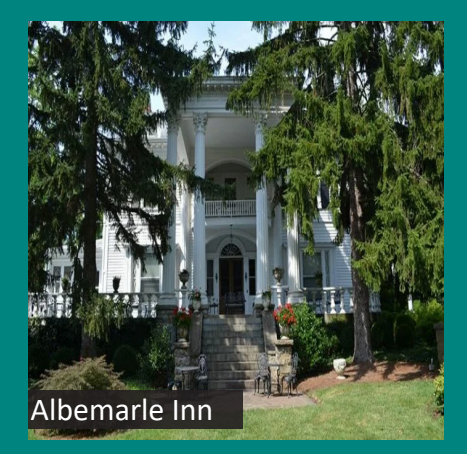
The inns feature gardens, verandas and outdoor spaces suitable for group getaways, special events, and weddings.