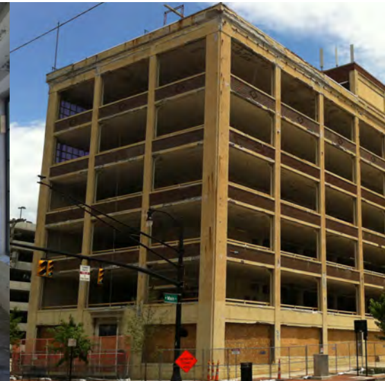
Before historic preservation

"global X helped us navigate the path to successfully enact a conservation easement and syndicate state and federal credits. Without the funding sourced through global X, a project like The Julian could never have been feasible."